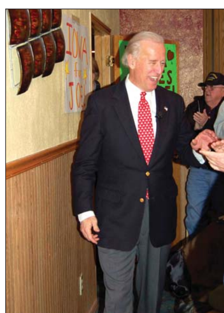
(ABOVE) OSKALOOSA, Iowa — Joe Biden, whose press secretary is a Truman alumnus, greets his supporters at a local restaurant.