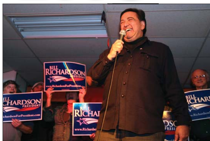
(LEFT) IOWA CITY, Iowa — Democratic candidate Bill Richardson, who now has withdrawn from the presidential race, enjoys a joke with several hundred supporters packed into a cozy restaurant.