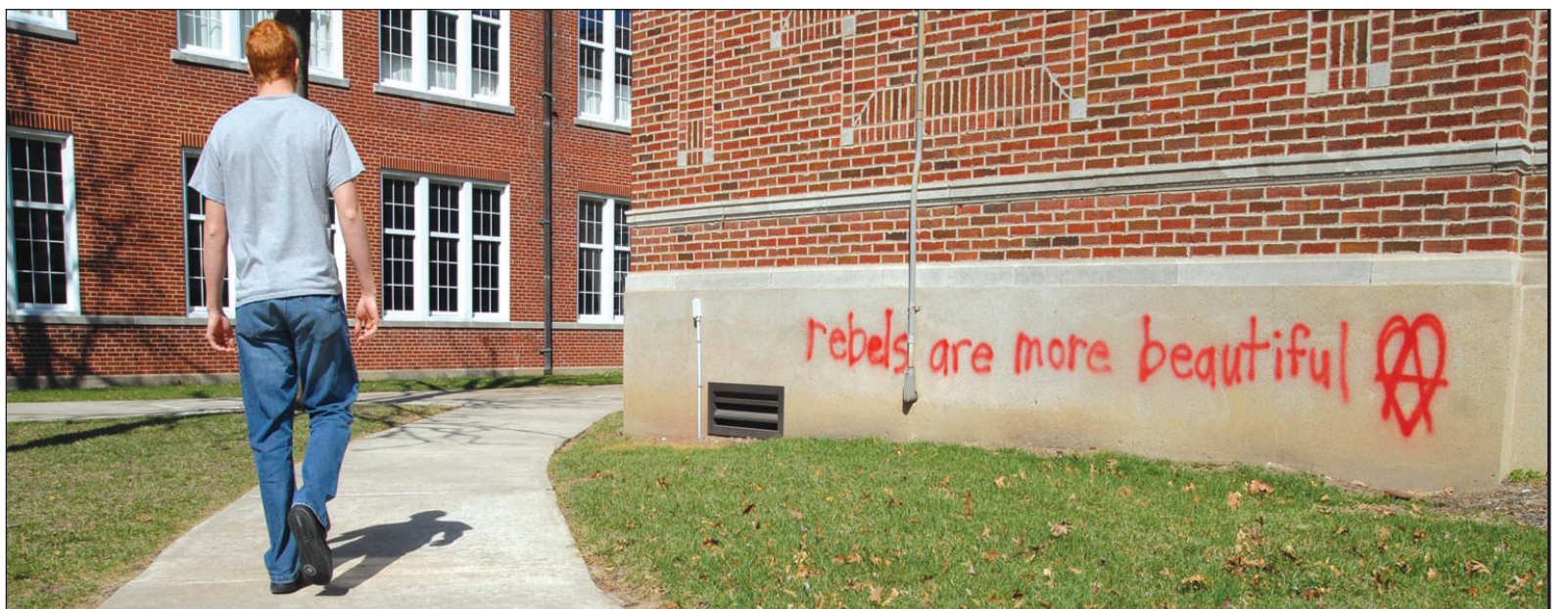
A student reported graffiti on Ophelia Parrish at 1 a.m. Saturday morning. Six other campus buildings and the Armory displayed spray painted messages. Physical Plant workers and student volunteers started the clean-up process Tuesday afternoon.