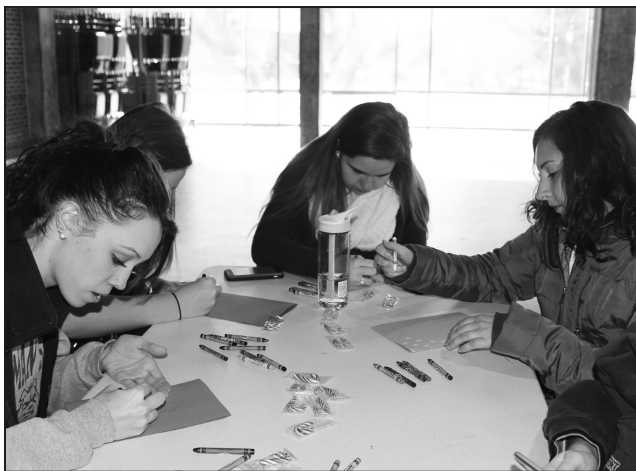
Truman students create cards for the residents of Kirksville Manor Care for the National Day of Giving. The group hosting the event provided props including a festive photo frame and letters for students to use to take pictures and post to social media using the Giving Tuesday hashtag.

In honor of the National Day of Giving, students were invited to make holiday cards to give to the residents of Kirksville Manor Care. The event was hosted by students from COMM 353: Public Relations. Students created a total of 132 cards, exceeding the group's goal of creating 86 cards.