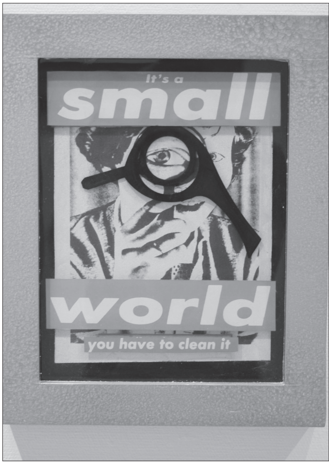
Trevor Stark/ Index